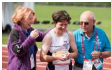
7000 Family members and supporters