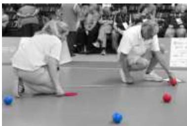
200 Sports Officials