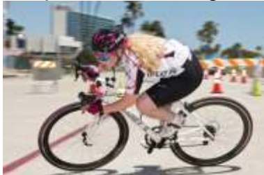
2600 Athletes with intellectual disabilities of all ages and abilities

The Special Olympics GB 2017 National Summer Games will take place in the city of Sheffield between 7 – 12 August and the Basketball competition will involve 22 athletes (6 teams) in the 3v3 competition and 126 athletes (15 teams) in the 5v5 competition all coming from 10 different delegations.