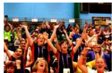
The largest disability multisport event in the UK