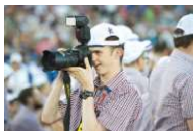
A huge media reach