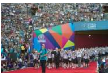
20 Delegations from Across Great Britain and Australia