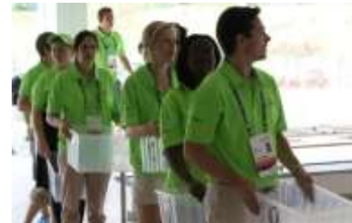
1000 Games Volunteers